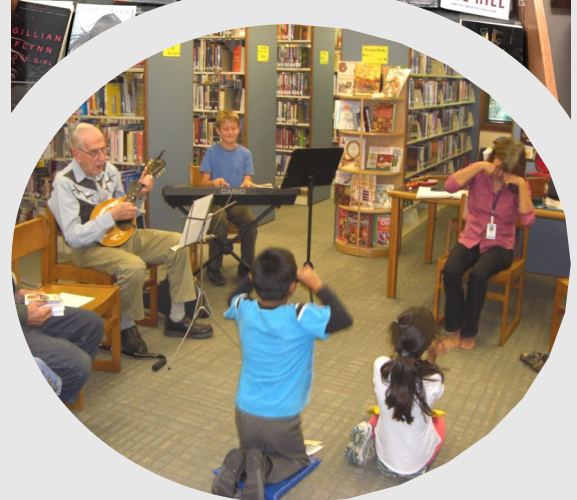
Patrons enjoy the tune “Babies on the Bus” during Edneyville’s Old-Time Sing-a-Long.